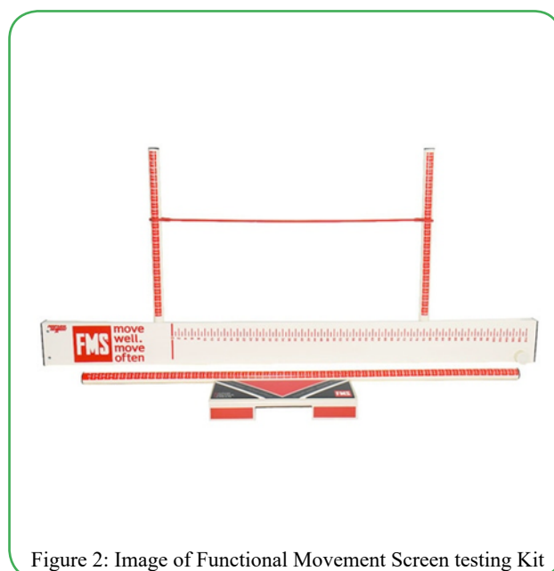
Figure 2: Image of Functional Movement Screen testing Kit